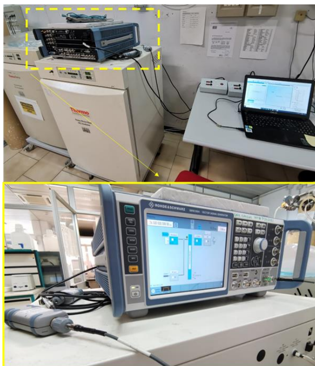
Figure 1. Exposure system setup. The signal is sent to the RC placed inside a cell culture incubator while a second RC, placed inside another cell culture incubator, is used for sham exposure. Each chamber is equipped with two stirrers at independently controlled speed and hosts a sample holder to allow reproducible positioning of the cell culture dishes.